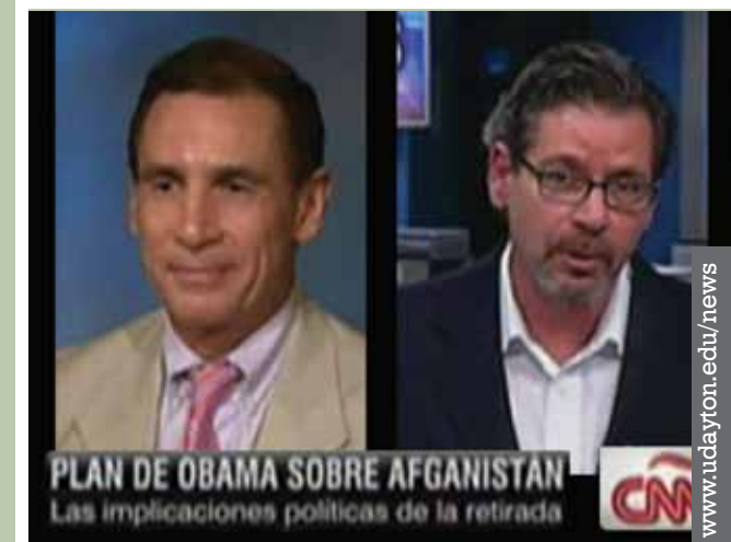
PLAN DE OBAMA SOBRE AFGANISTAN Las implicaciones políticas de la retirada