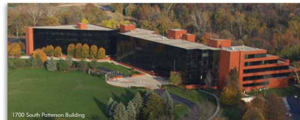
1700 South Patterson Building

Ohio news media covered a July 30 press conference held at the 1700 South Patterson Building by then-Gov. Ted Strickland to announce Ohio Job Ready Site program grants, including an award of $3.5 million to help transform the former NCR world headquarters for use in research and development. Dayton-area news media and outlets statewide including The Plain Dealer (Cleveland) and The Cincinnati Enquirer reported on the award.