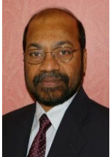
Vijayan Asari Computer Vision, Pattern Recognition, Machine Learning, Digital Architectures