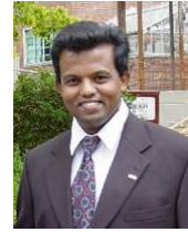
Andrew Sarangan Optoelectronics device technology, Photo- detectors & Image Sensors, Optical & Nano-structured thin films, Nano-fabrication & MEMS