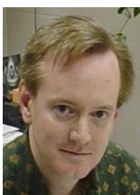
Bradley Duncan Optical Remote Sensing, Image Processing