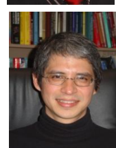
Raul Ordonez Adaptive, Nonlinear, Robotics Control