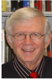
Donald Moon Digital & Computer Systems, Avionic Systems, Displays