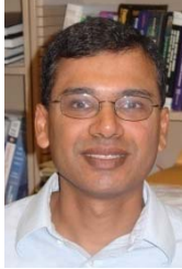
Guru Subramanyam Microelectronics, Electronic Materials, and Microwave Electronics