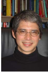
Raul Ordonez Adaptive & Nonlinear Control