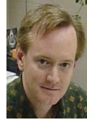
Bradley Duncan Optical Remote Sensing, Image Processing