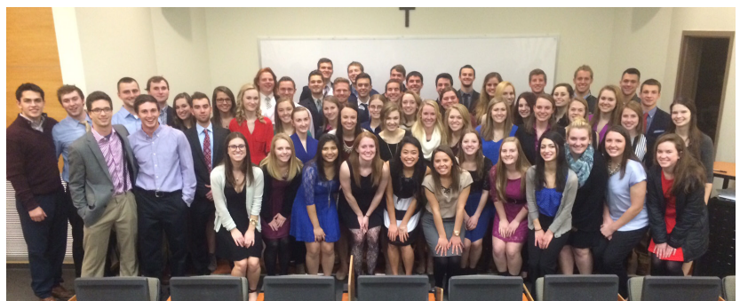
Newly initiated members of Alpha Epsilon Delta