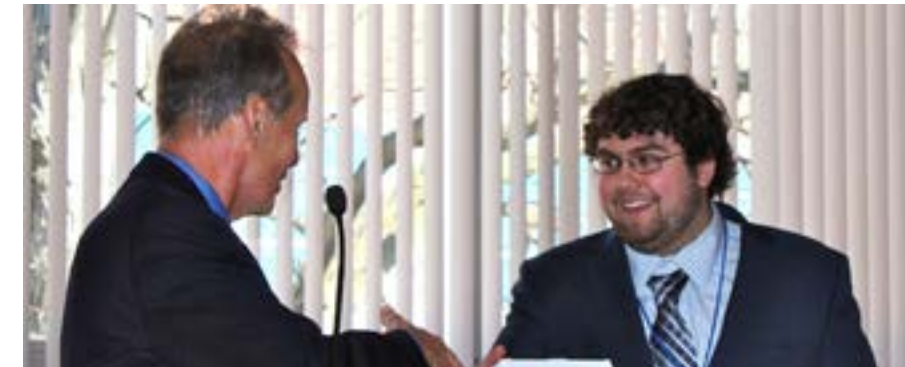
UD/Miami Valley Hospital Healthcare Symposium 2013