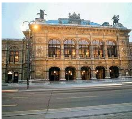
Vienna State Opera