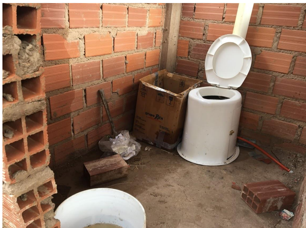
Figure 1: Example of composting toilet