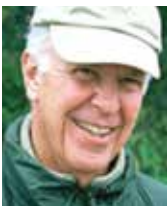
PARKER PALMER (Video) The Heart of Democracy