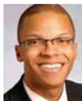
TERRELL L. STRAYHORN The Pursuit of Belonging