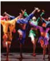
DAYTON CONTEMPORARY DANCE COMPANY