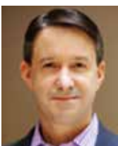
JEFFREY SELINGO College (Un)bound