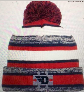
New Era® Sideline Beanie. NE902.