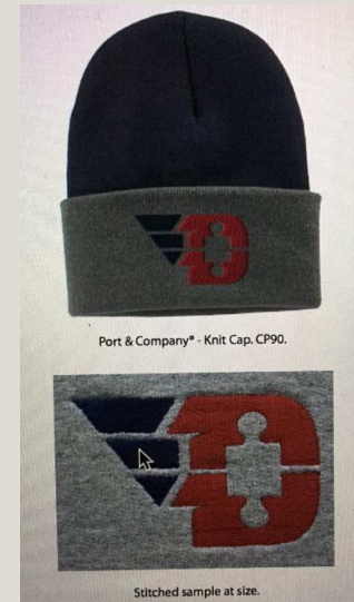
Port & Company® - Knit Cap. CP90.